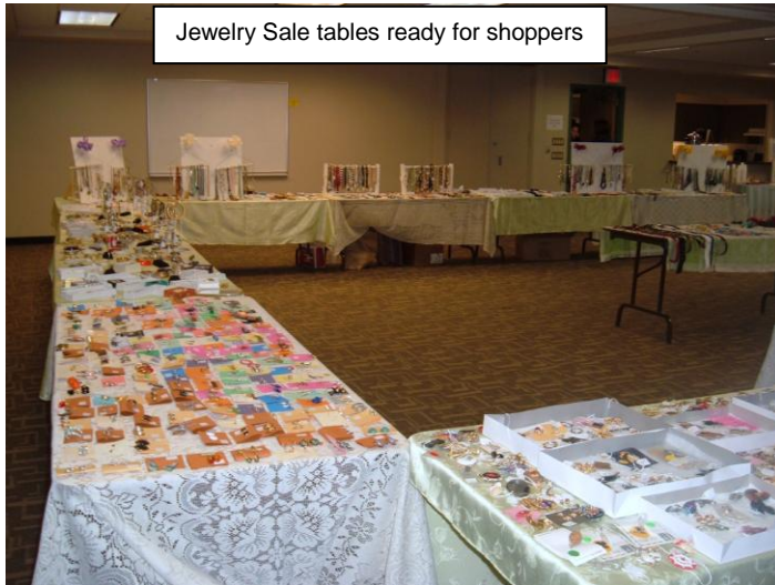
Jewelry Sale tables ready for shoppers

The photos below are from our fabulous Jewelry Sale held on October 23, 2010, made possible by the beautiful jewelry donated by our wonderful library patrons. The event raised over $4,700 for library programs and was a lot of fun. As a result of the many requests and comments from those who attended, we plan to make this an annual event and will gladly accept jewelry donations all year long.