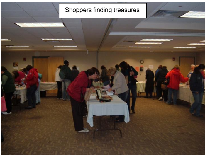
Shoppers finding treasures